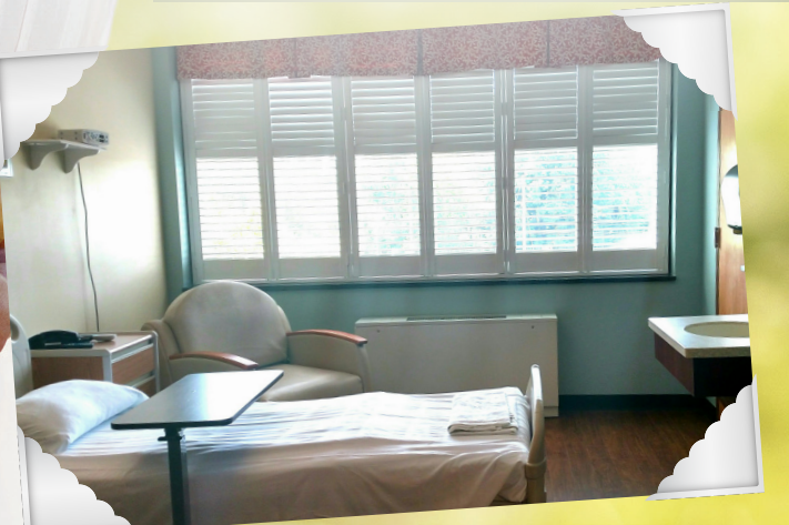
A private and spacious room for babies and new families

We recognize that having a baby can bring upon a lot of joy....but also a lot of anxiety!