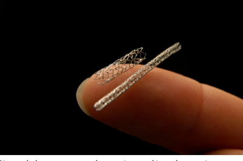
Pictured above are stents that are inserted into the arteries

Other procedures for cardiac conditions are also available, such as the right heart catheterization, which allows the physician to screen for congestive heart failure or increased pressure in the heart or lungs. This enables the cardiovascular team to determine the course of treatment for heart failure patients or pulmonary hypertension patients. The transesophageal echo is also performed in the new lab, where a physician inserts a large tube into the esophagus to perform an ultrasound of the heart. By doing this, the physician can fully evaluate the valves and other cardiac structures. Procedures are also available to correct heart rhythm, called cardioversion.