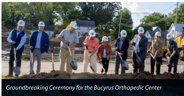
Groundbreaking Ceremony for the Bucyrus Orthopedic Center

The new medical clinic will offer a range of specialized therapy programs, including sports injury rehabilitation, female and male pelvic floor therapy, vestibular and balance therapy, lymphedema treatment, stroke rehabilitation, and gait training. Central to gait training is the new Solo Step support system, which is a