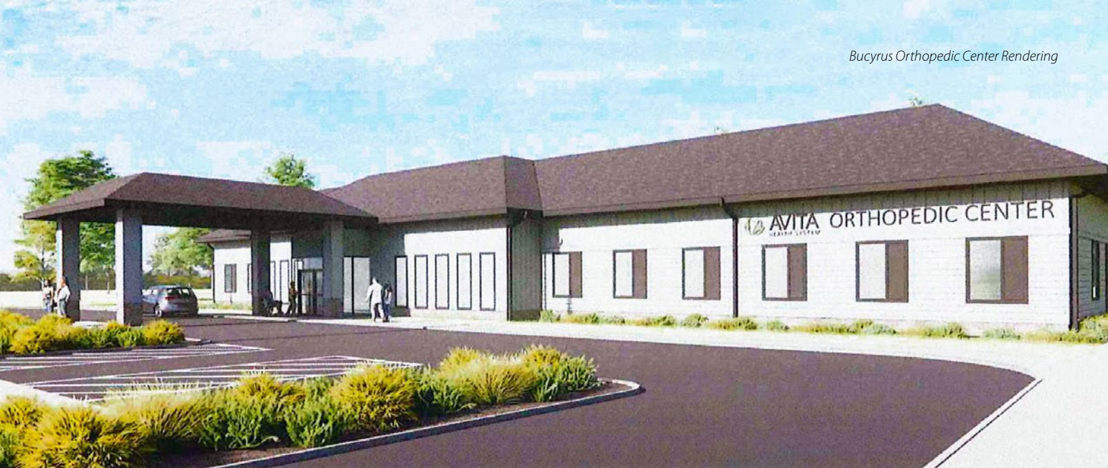
Bucyrus Orthopedic Center Rendering